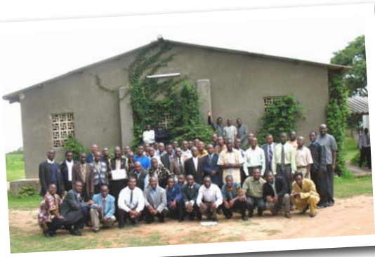
Zambian Pastors at the conference

Second, a spirit of brokenness came. Right after the opening message, there was a time of silent prayer followed by a time of prayer where leaders took turns praying aloud. This was not directed by our team in any way...we didn't say, "pray for ____." Yet, the Spirit moved hearts to cry out to the Lord in repentance. Repentance for having wrong priorities, repentance for sins, repentance for not reaching out to the lost, repentance for not discipling the next generation... On and on the prayers came - Some in shouts and some in softness, some with anger and some with weeping, some in English and some in local dialects...all directed toward the one true God of the universe. All asking God to lead us where He wills and to empower us to obey and follow His directing. What a powerful time of humble submission!